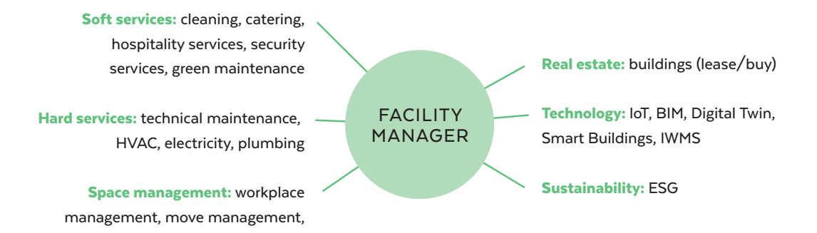
Figure 1.1: The facility manager is central.

The mention of ISO is noteworthy in this definition. When an ISO standard is developed for a discipline, it certainly means it is a crucial part of any comprehensive corporate policy. The standard 'ISO 41011:2017 – FM' not only illustrates the importance of FM but also suggests that it is a field with complex interactions and procedures – a suspicion that is, of course, entirely justified. The definition also refers to the built environment and places; in this book, we will focus on the workplace and work environment in a 'corporate office' environment. Naturally, many things are also applicable to other sectors and environments. The facility manager has the important task of contributing to the workplace and the environment. He/she is central and can create an impact on a multitude of domains, as you will see in the illustration below.